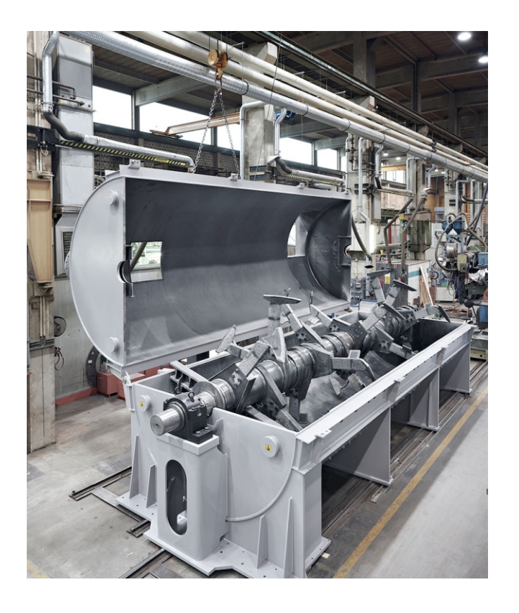
Fig. at the top: View inside the mixing drum Fig. at the bottom: Mixing drum getting closed by using a crane

The mixing and granulating technology for the production of sinter in the steel industry has to overcome particular challenges due to the extremely abrasive materials and high throughputs. Although conventional systems used for production are low-maintenance, they cannot achieve the required quality of mixture and grain size distribution. In particular, they cannot be used for processing materials such as fine iron ore and pellet feed. Therefore intensive mixers and granulators provide an attractive alternative as they achieve an excellent mixing quality and optimum permeability, thus increasing the efficiency, productivity and profitability of the sinter plant. Lödige developed the KM 57000 SIN as a solution for this heavy duty application. The largest mixer ever produced in the history of the company stands out for its excellent wear protection and ease of maintenance: Thanks to its two-part design the eight metre long drum of the mixer can be opened to allow optimum accessibility to the interior of the mixer.