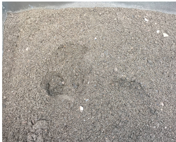
Homogenized/hygenized FGD products

In the Lödige Mixing system byproducts from power stations are mixed to produce stabilizer, i.e. on the basis of dusts of desulphurizing units. Waste products, e.g. gypsum suspensions from flue gas desulphurization units, are mixed homogeneously with fly ash from brown coal incinerators in suitably equipped Lödige Mixers. The aim is to utilize the pozzolanic properties of the fly ash. If a suitable recipe is chosen, these materials provide, amongst other things, the physical properties which make the solid material suitable for storage.